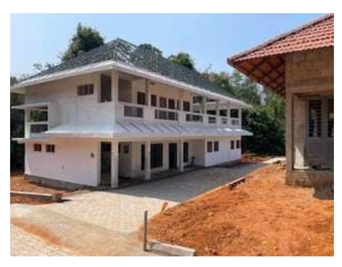
Community centre in the new village, Photocredit RCI India