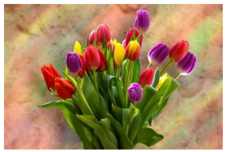
Colourful tulips for the day of honour.

We wish you good health and all the best! 🎁 💝