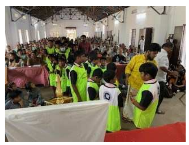
Festival in Butterfly Village