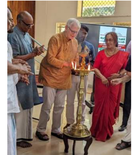
Big event at Mahatma Gandhi University in the context of »University for Third Age (U3A)