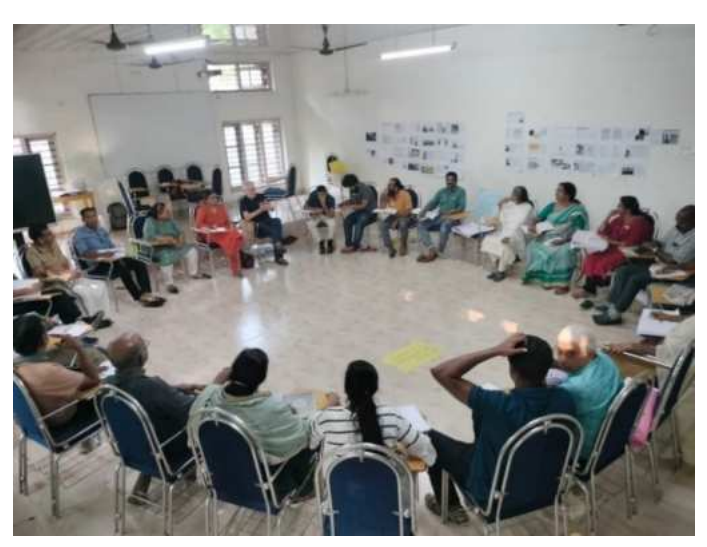
Workshop and interfaith meeting on "All-Connected into a Planetary Future"