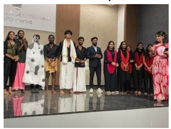
Study day with lecturers and students at Marian College "Theme-Centered Interaction (TCI) as a Pedagigic Approach for Holistic Learning in Higher Education