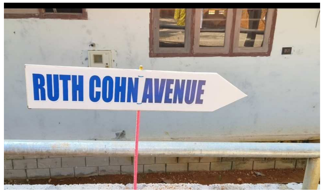
Please, this way.