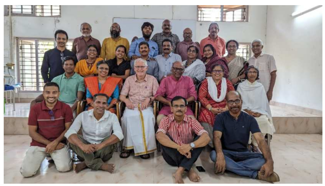
Workshop at the Mahatma Gandhi University

The venue was Directorate for Applied Short-term Programmes (DASP) at Mahatma Gandhi University, Kottayam. The international TCI workshop had 18 sessions through 12th – 15th January 2024.