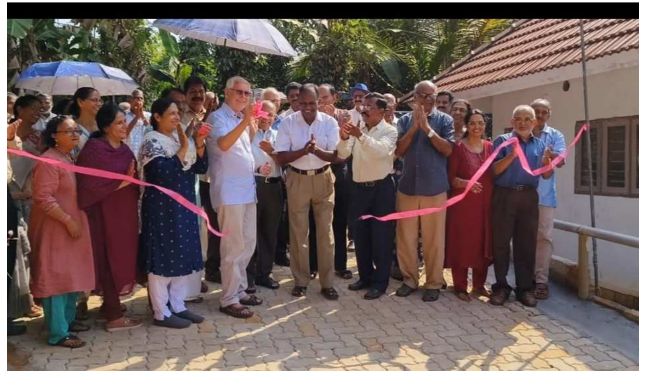
Applause for Ruth Cohn Avenue at the inauguration on 23 January 2024.