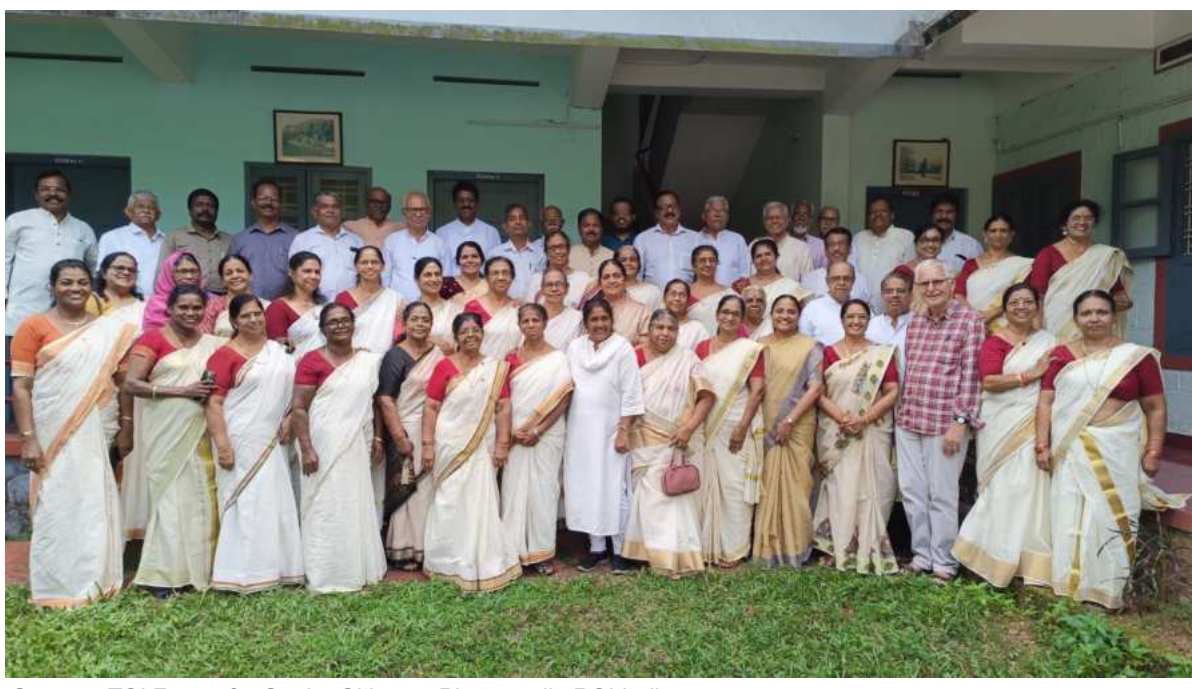
Synergy TCI Forum for Senior Citizens