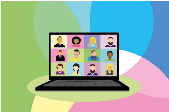
Abbildung 2

07 April 2022, 6-8 P.m.: Participating - how I lead and how I am (best) led Conducted by: Klaus Kuske