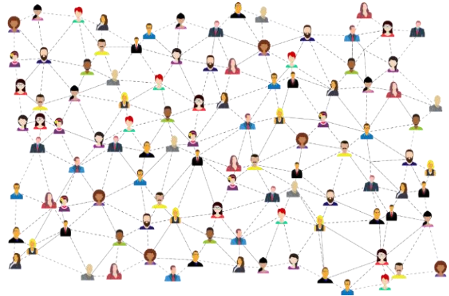
Abbildung 1

The next step is now to build a community. Because we do all this in addition to our many daily tasks, we need your support. Please take a look here and subscribe to the pages, leave a "like", a "heart" or a friendly comment.