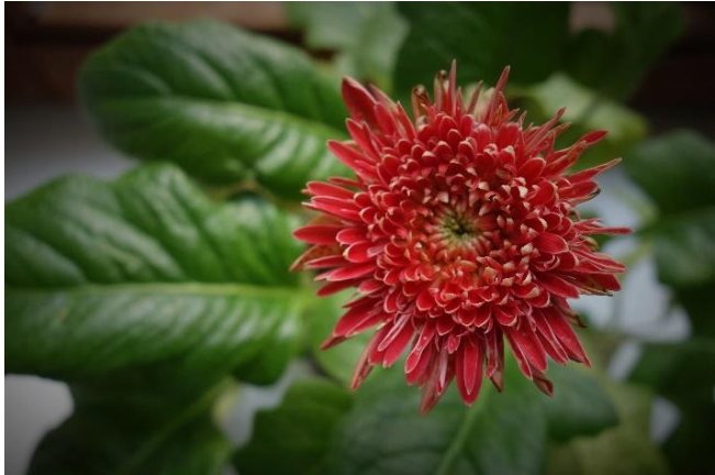
Just in time for the RCI-News 2/2022 our office flower got a blossom.

RCI-NEWS 3/2022 will be published on August 26, 2022