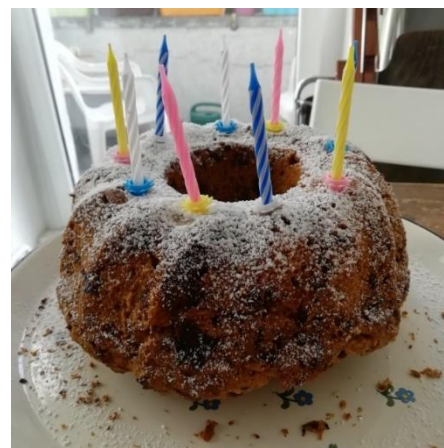
Happy Birthday.

It is a matter close to my heart to congratulate you, as my oldest TCI and RCI friends, in this public setting especially on your anniversary birthdays in 2022.