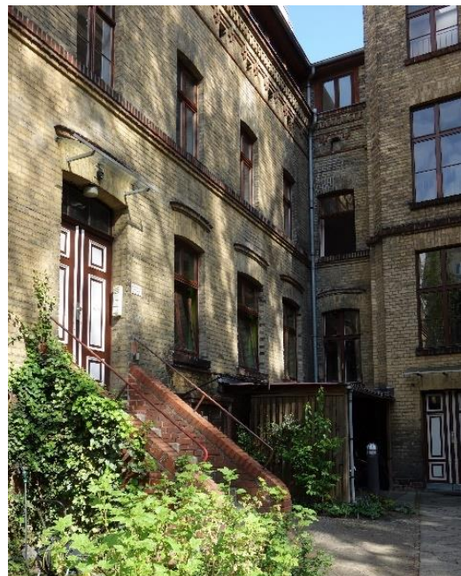
Welcome at the Main Office of RCI international in Berlin!

The sun and the blossoming of nature will certainly contribute their part to it.