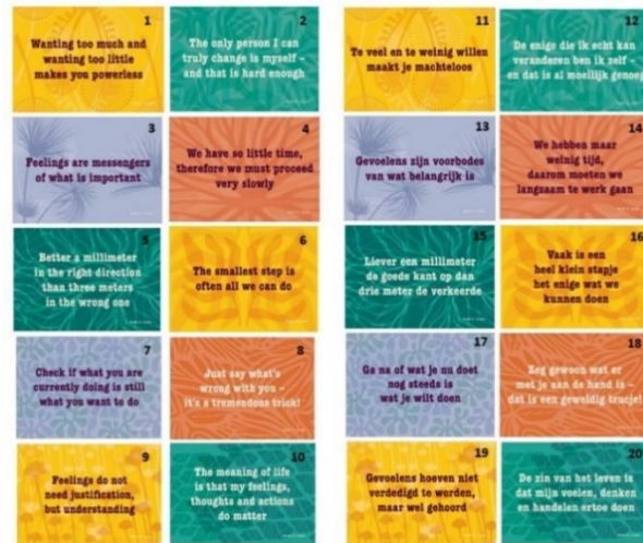
Click on the image to go directly to the shop page.