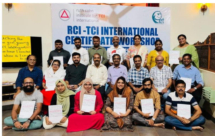
Certificate workshop in Nilambur, Kerala.

We take this opportunity on behalf of the Training Committee to thank all the graduates and officers of RCI-international and RCI India who have contributed to achieving this goal.