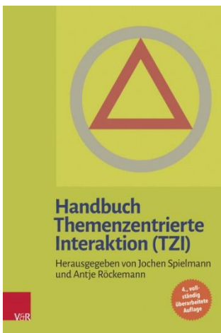
Handbook of theme-centred interaction