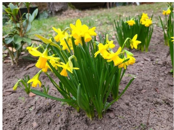
Daffodils in the backyard.