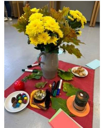
At the start of the course