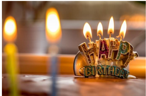
Happy Birthday.

We wish you good health and all the best! 🎁🌱