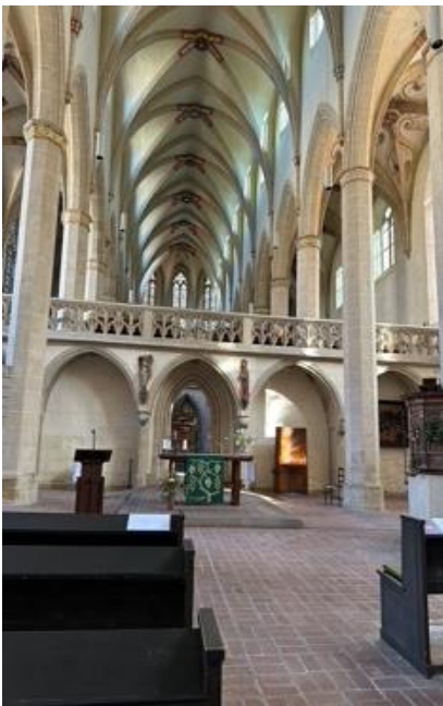
Predigerkirche in Erfurt