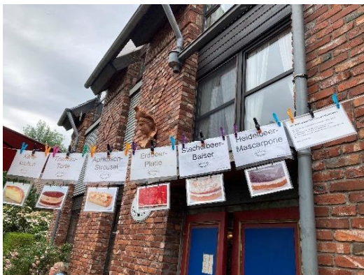
Stop for coffee and cake in the café.

The easy 2 ½ -hour hike (approx. 10 km) takes us through the Hühnerbachtal valley over the heights near Millrath along the Düssel to our destination Gruiten-Dorf. The café in the village there (Pastor-Vömel-Str. 20) has a reservation for us and there will be opportunity to continue the conversations we had on the way and/or start new ones.