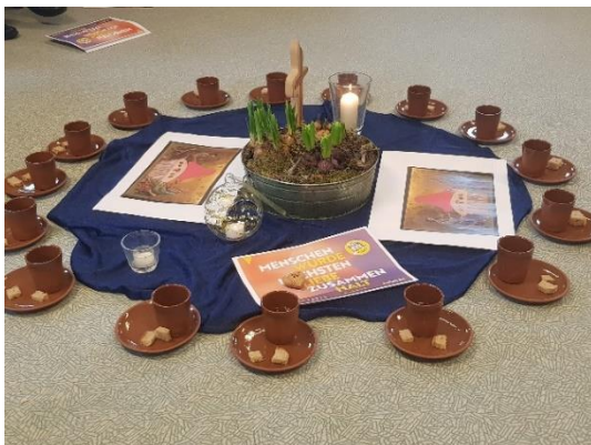
Altar of the peace service as a designed centre

FriedensMut - From a biblical understanding of peace to a theology of peace for the future. This topic brought together 18 members of the professional group and interested parties from 24-26 January 2025 at the Ebernburg in Bad Münster am Stein for a conference.