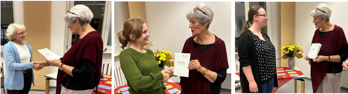
Ceremonial presentation of the TCI certificates.

The joint celebration strengthened the group spirit and offered the opportunity to express mutual recognition and appreciation.