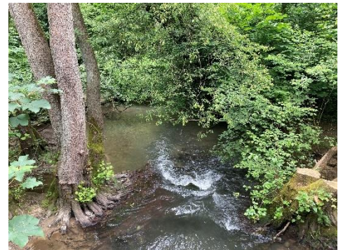
Exchange in the fresh air.

On 10 May 2025, we will start at 11 a.m. at the station in Haan. Arrival from both Wuppertal and Cologne is possible with the RB 48. Those arriving by car will find parking spaces at the station, but will have to take the bus and train back to their car at the end.