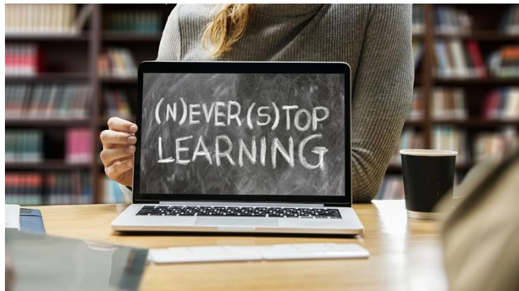
Congratulations 20 years of FöVe