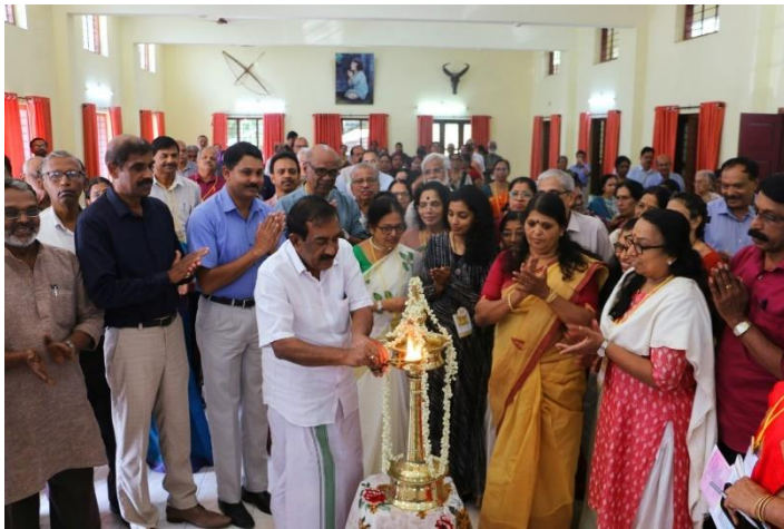
MLA lighting up and inaugurating the TCI-U3A butterfly meet at Vazhoor in Kottayam district of Kerala.

From 10 to 15 January, 169 TCI learners from all over Kerala gathered in Vazhoor near Kottayam in Kerala for a half-hearted review. The focus of the meeting was on clarifying the unique U3A model that we have developed with TCI, as well as