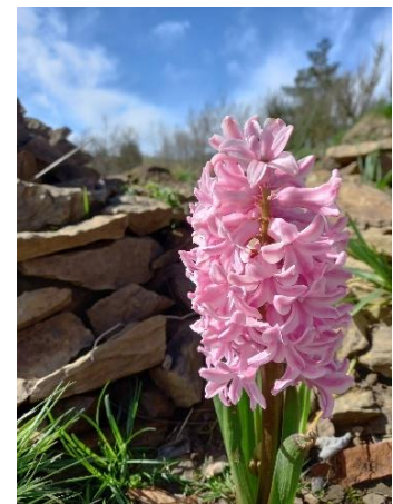
Spring is just around the corner