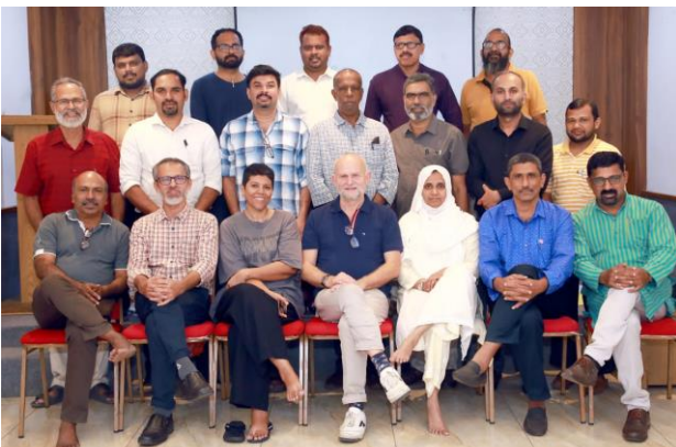
5 Days TCI WORKSHOP 3--7 January 2025 At Hotel King Fort Kozhikode