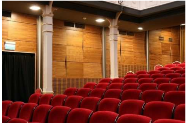
Cinema room

In the Völklinger Hütte, a World Heritage Site, you can visit the much-praised film exhibition of German film from 1895 to the present day. We would like to invite you to take a look together at the time in which Ruth Cohn grew up in Berlin. Filmclips from this early period will allow us to get closer to her experience. Likewise the time of her return to Europe, which many of us already consciously perceived. Filmclips from "Berlin. Synfonie der Großstadt" from 1927 or "Hitlerjunge Quex" in 1933, through to "Angst essen Seele auf" from 1974, the year of Ruth Cohn's return to Europe. Limiting the exhibition to two epochs is one way of approaching it.