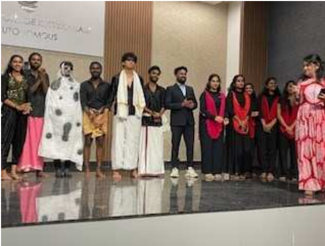
Study day with lecturers and students at Marian College "Theme-Centered Interaction (TCI) as a Pedagogic Approach for Holistic Learning in Higher Education, Photocredit: RCI India