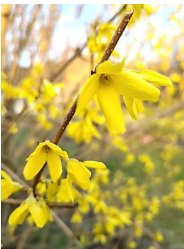
Spring