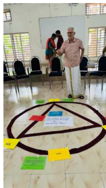
Workshop in Kerala