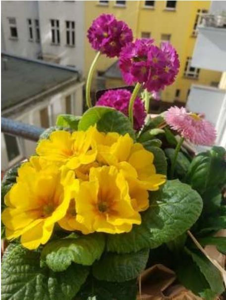
Greeting from the balcony.