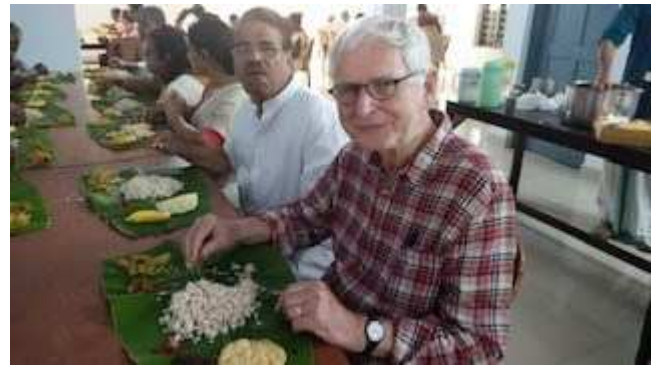
Lunch break with delicious Indian food