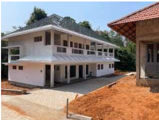
Community centre in the new village