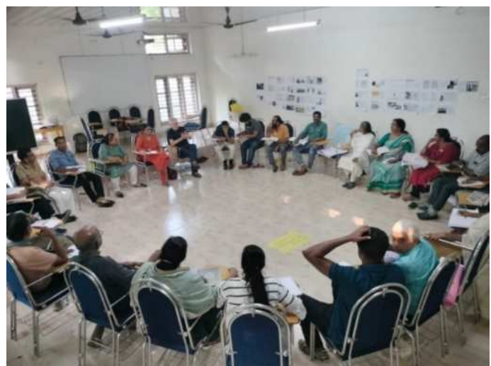
Workshop and interfaith meeting on "All-Connected into a Planetary Future"