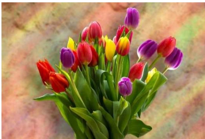
Colourful tulips for the day of honour.

We wish you good health and all the best! 🎁 🌸