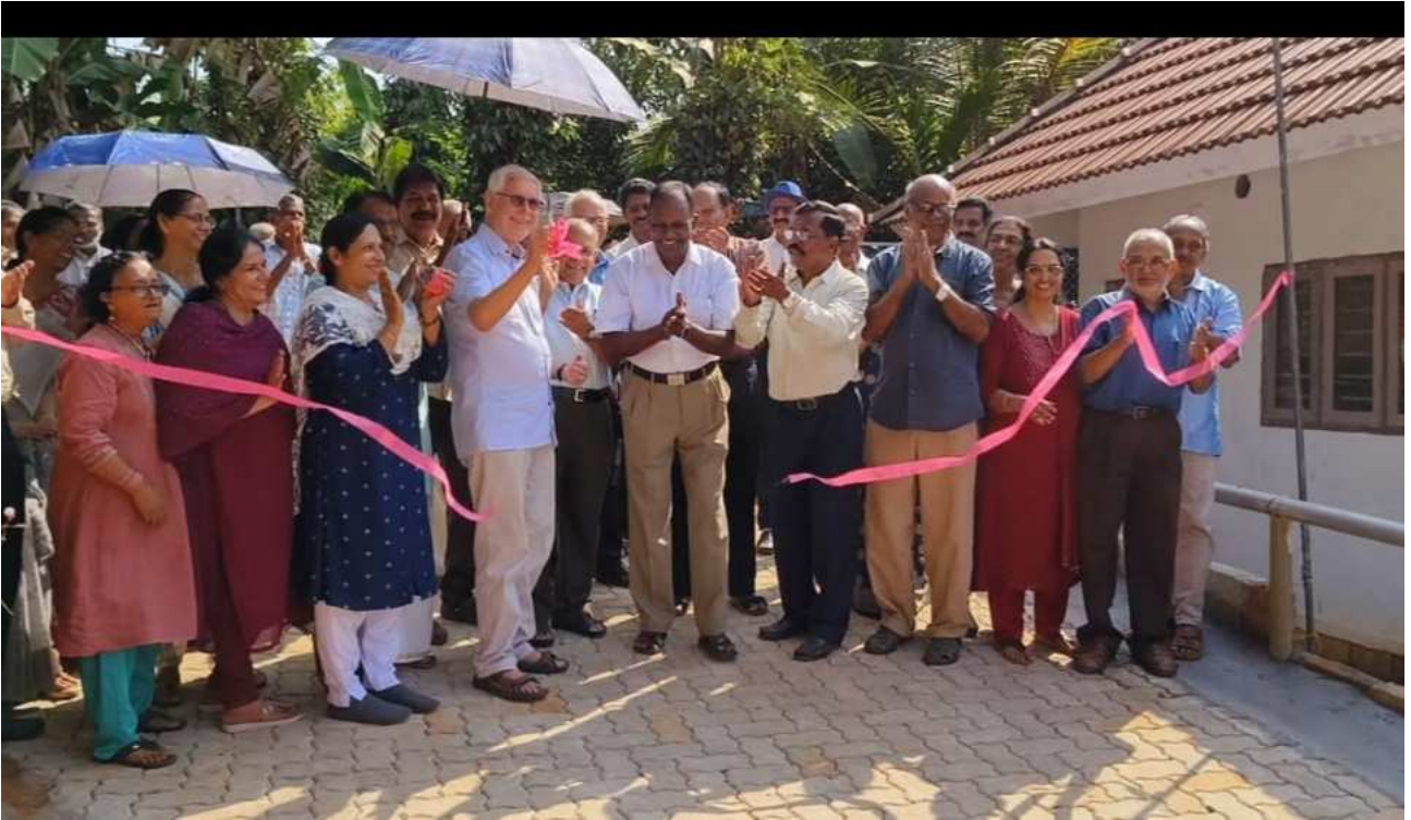
Applause for Ruth Cohn Avenue at the inauguration on 23 January 2024.