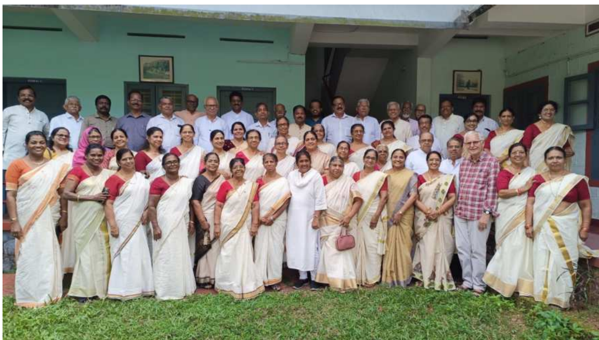
Synergy TCI Forum for Senior Citizens