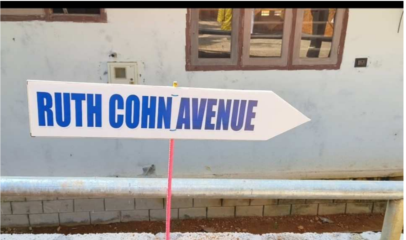
Please, this way.