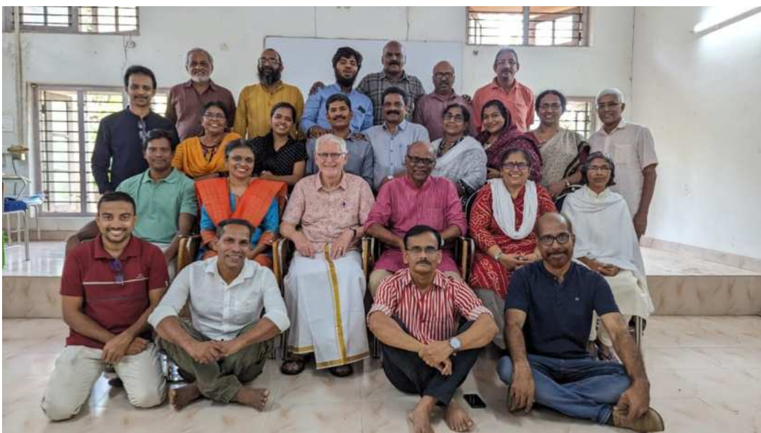
Workshop at the Mahatma Gandhi University

The venue was Directorate for Applied Short-term Programmes (DASP) at Mahatma Gandhi University, Kottayam. The international TCI workshop had 18 sessions through 12th – 15th January 2024.