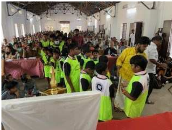
Festival in Butterfly Village