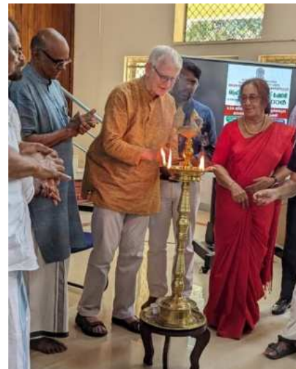
Big event at Mahatma Gandhi University in the context of »University for Third Age (U3A)