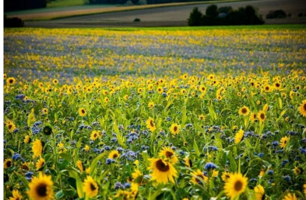
Summer meadow.

We wish you good health and all the best! 🎁 🌿