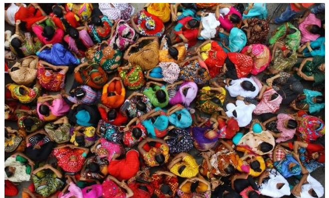
Everybody is welcome to TCI.