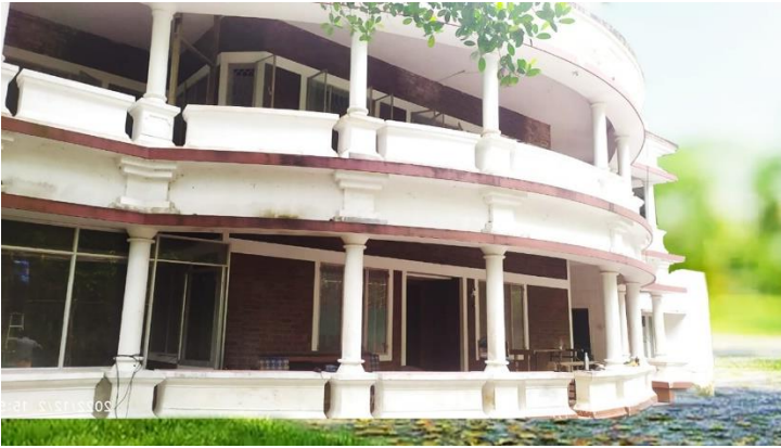
The RCI India office in Kottayam district, Photo credit: RCI India

The building, shown here, will house the headquarters of TCI's pursuits in India.