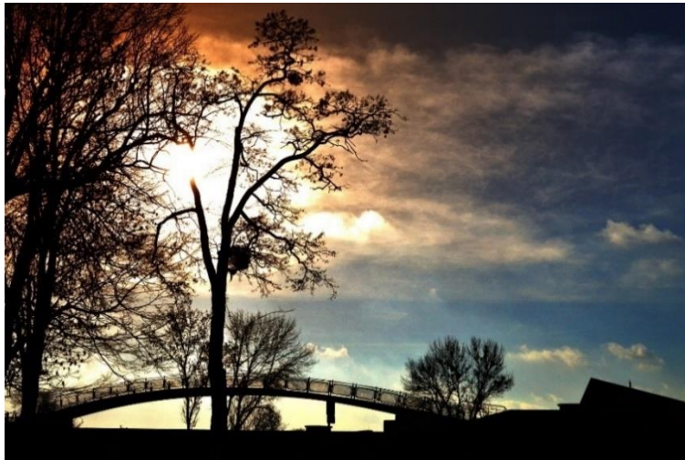
Bridge to communication

Sunday, 03.11.2024, 9:30 am to 5:15 pm, Haus am Dom - Frankfurt am Main