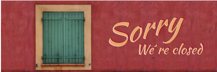
Sorry, we are closed today!