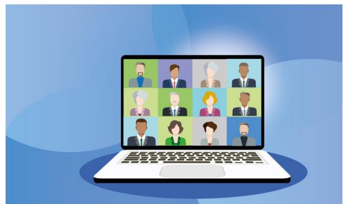
Digital exchange - Photo credit: Alexandra_Koch on Pixabay