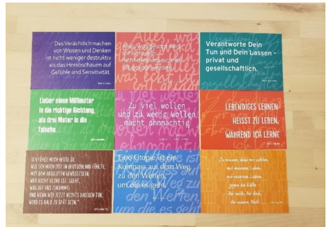
Extract from the new postcard range.