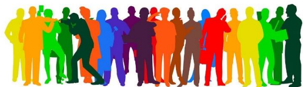
TCI exchange in Düsseldorf